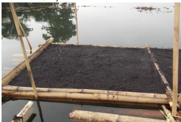
Figure 3. A raft full of soil for growing rice