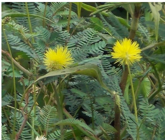
Figure 1. Water mimosa ( Neptunia prostrata Lam.)