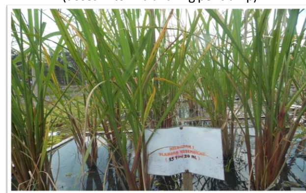
Figure 4. Growing local yellow paddy on a raft

besides BC contained high P. High filled grain was similar to result on research done for brown gelatinous rice on the rafts with the application of 10 ton ha -1 crumble compost had produced more than 90% filled grain (Bernas et al., 2012). BC was made of water mimosa, this was a weed growing vigorously in swampland rice field (Bernas et al., 2015) and thus farmers could collect and use it for compost to increased rice yield.